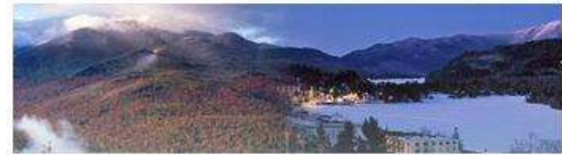
Northern New York Health Information Management Association